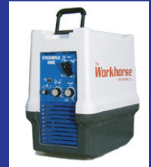
Workhorse 300S Stick/Lift Start TIG