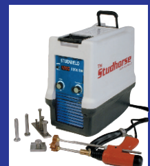
Studhorse 1000DM & 1200DM Stud Welders