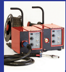
Wire Feeders WF200R and WF400R