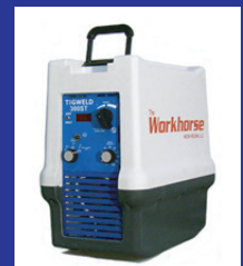
Workhorse 300ST ArcStarter TIG