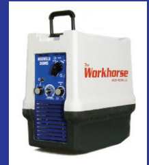
Workhorse 300MS MIG weld