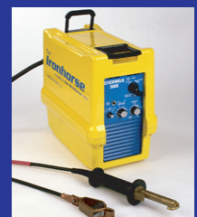
Ironhorse 300S 700V DC Input