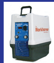
Workhorse 300ST ArcStarter TIG