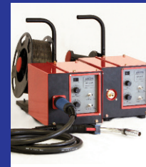
Wire Feeders WF200R and WF400R