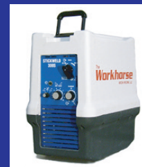
Workhorse 300S Stick/Lift Start TIG