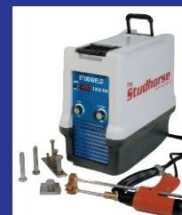
Studhorse 1000DM & 1200DM Stud Welders