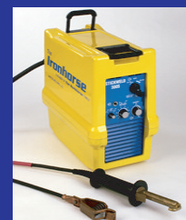
Ironhorse 300S 700V DC Input