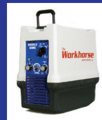
Workhorse 300MS MIG weld