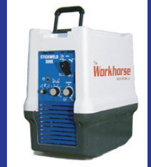
Workhorse 300S Stick/Lift Start TIG