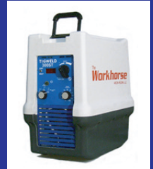
Workhorse 300ST ArcStarter TIG