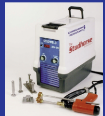
Studhorse 1000DM & 1200DM Stud Welders