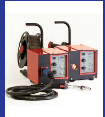
2 Roll or 4 Roll Wire Feeder