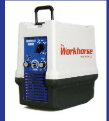
Workhorse 300MS MIG/Stick