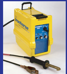
Ironhorse 300S 700V DC Input